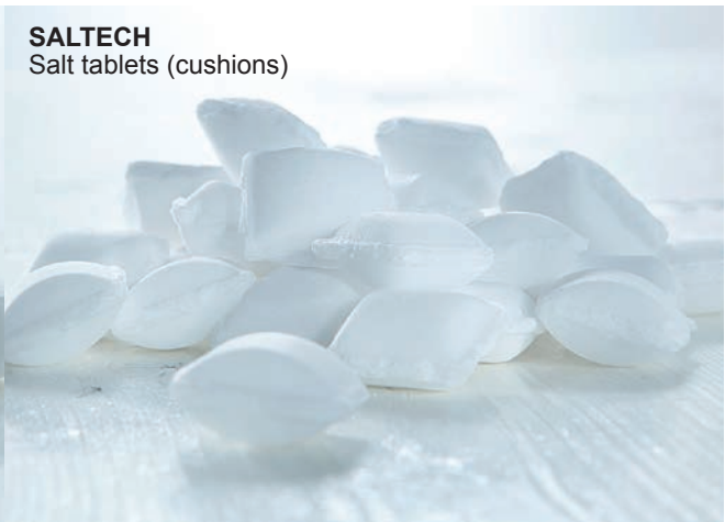
SALTECH Salt tablets (cushions)