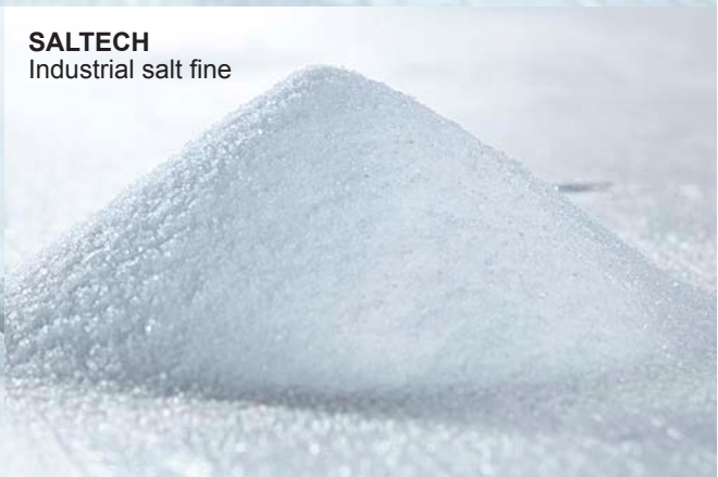
SALTECH Industrial salt fine