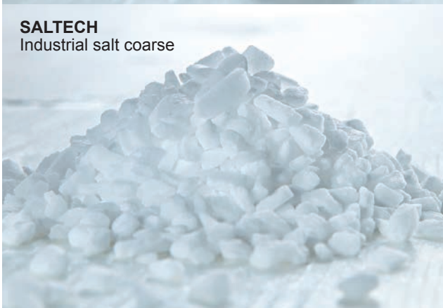
SALTECH Industrial salt coarse