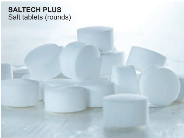
SALTECH PLUS Salt tablets (rounds)

No matter what form - we guarantee the highest purity. For salt tablets „rounds“ and „cushions“ the sodium chloride content is 99,9%.